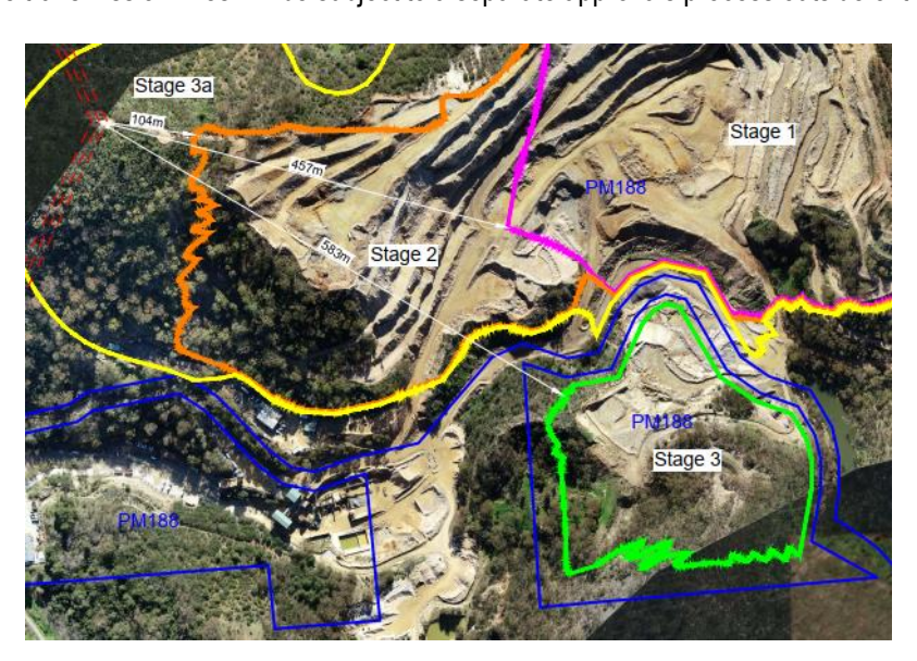
Diagram 1 – Separation Distances to Power Infrastructure

The relocation of the transmission lines will be subject to a separate approvals process outside of the Mining Act 1971.